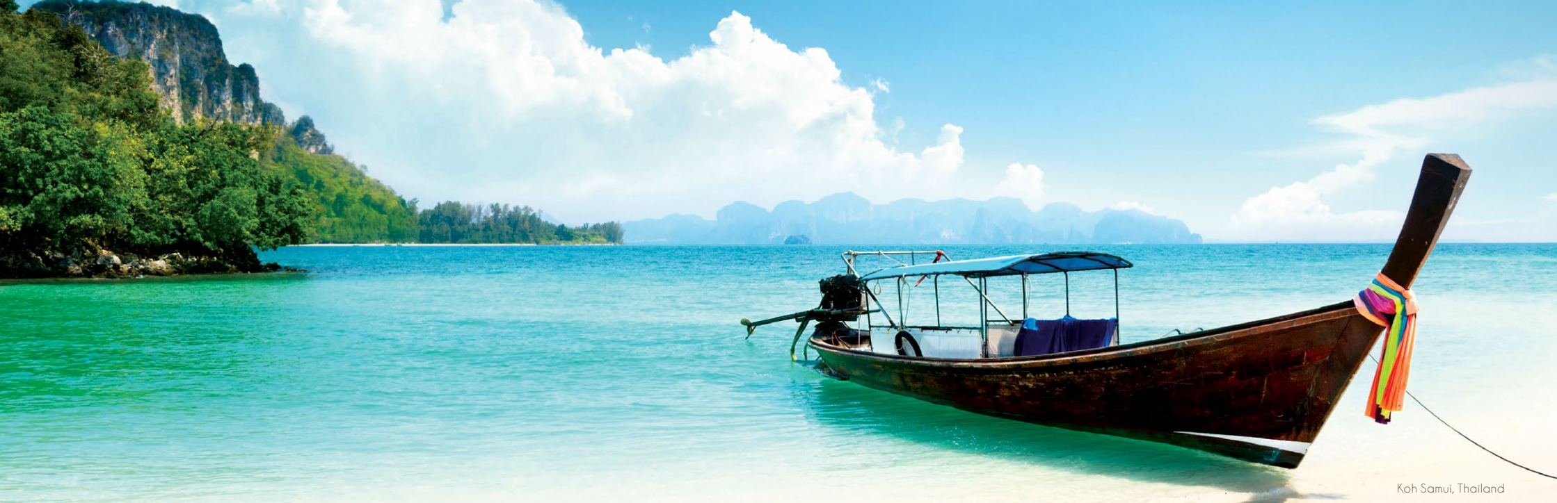
Koh Samui, Thailand