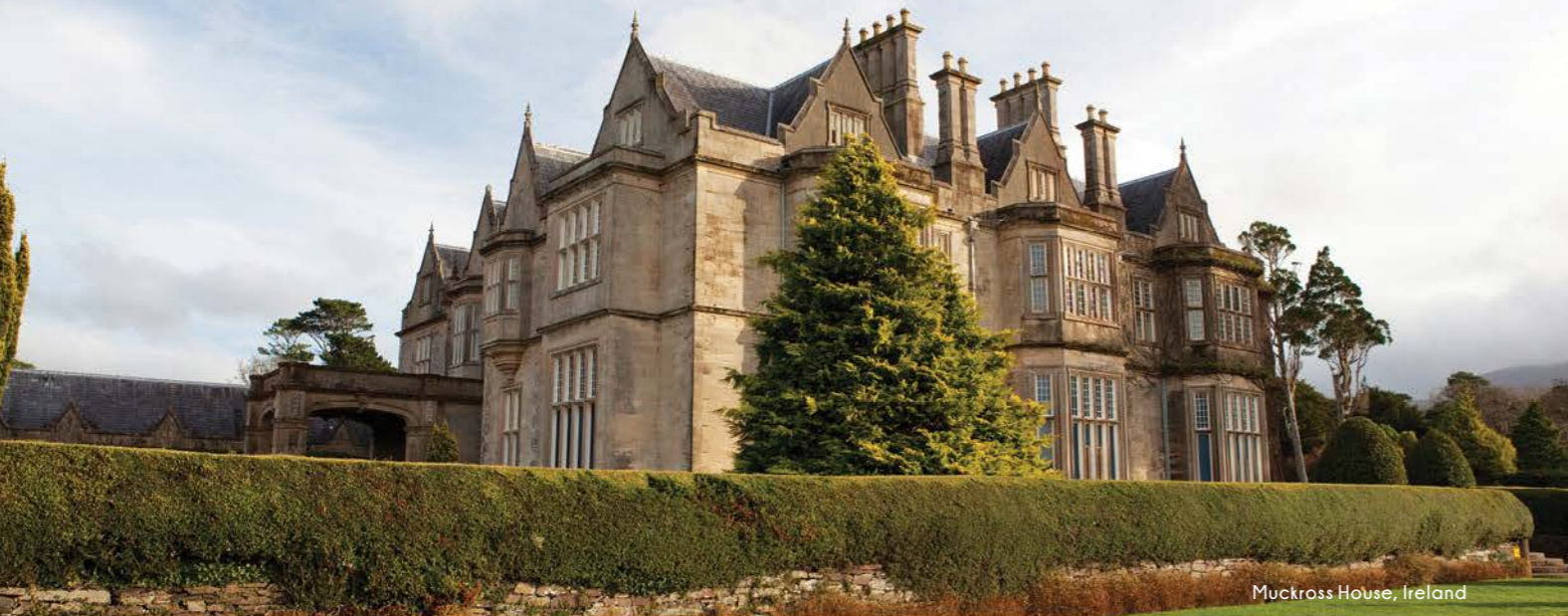
Muckross House, Ireland