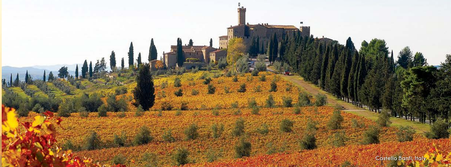
Castello Banfi, Italy