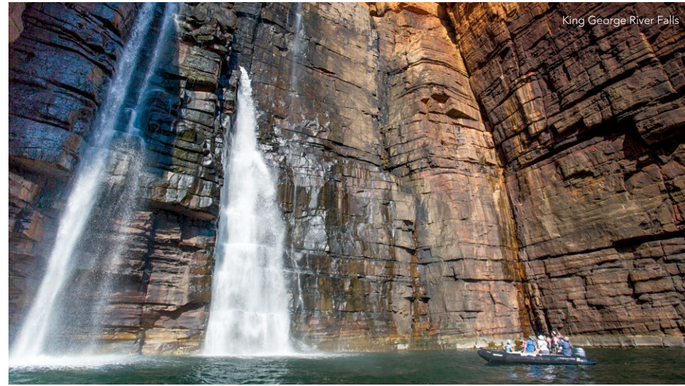
King George River Falls