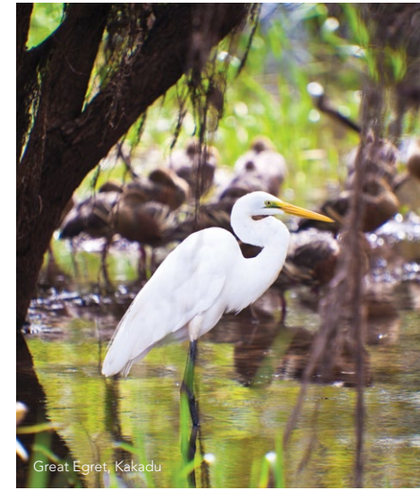
Great Egret, Kakadu